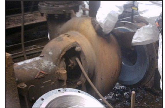
Installing coated cover with damaged cover in foreground