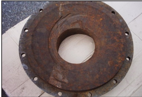
Worn pump cover

Abrasive wear of the pump wear plate from the iron powder slurry. The severe wear was a key source of the inefficiency.